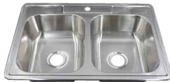
(1-Hole Configuration Shown)