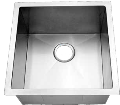
Shown with “Zero-Edge” corners