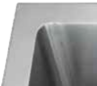
R15mm “Radial” Corner Detail