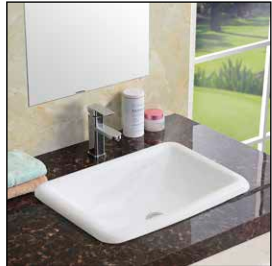
Installed Product Image

Please note: All porcelain sinks are fired at a very high temperature; final dimensions may vary slightly.