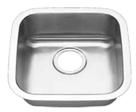
--- Dimensions ---Outer 16-1/2" x 18-1/4" x 8" Inner 14" x 15-3/4" x 8"