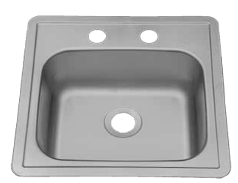
--- Dimensions ---Outer 15" x 15" x 5-1/2" Inner 12" x 10" x 5-1/2"