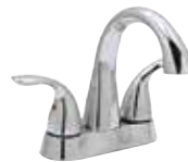
High Arc Vanity Center Set (4")