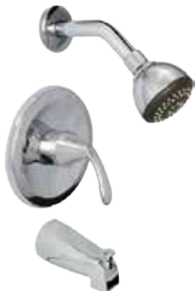
Tub and Shower Trim Package