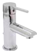
Vanity Single Control