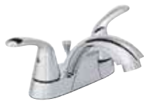
Vanity Center Set (4")