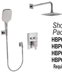
Shower Push Button Package