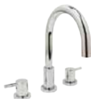
Vanity Wide Spread (8")