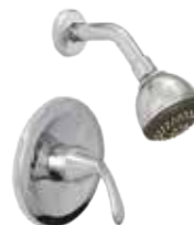
Shower Trim Package