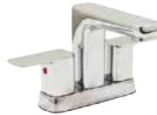
Vanity Center Set (4")