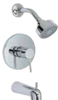
Tub and Shower Trim Kit