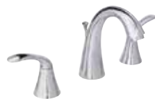
Vanity Wide Spread (8")