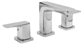
Vanity Widespread (8")