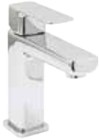
Vanity Single Control