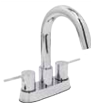
Vanity Center Set (4")