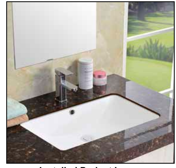
Installed Poduct Image

Please note: All porcelain sinks are fired at a very high temperature; final dimensions may vary slightly.