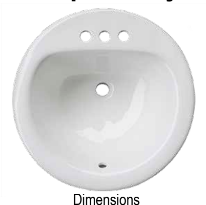
Outer: 19-1/8" dia.x 8" Inner: 15" x 13" x 6"