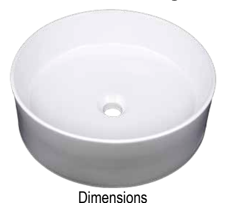
Outer: 18-1/4" diameter x 6-3/4" Inner: 17-1/8" diameter x 4-5/8"