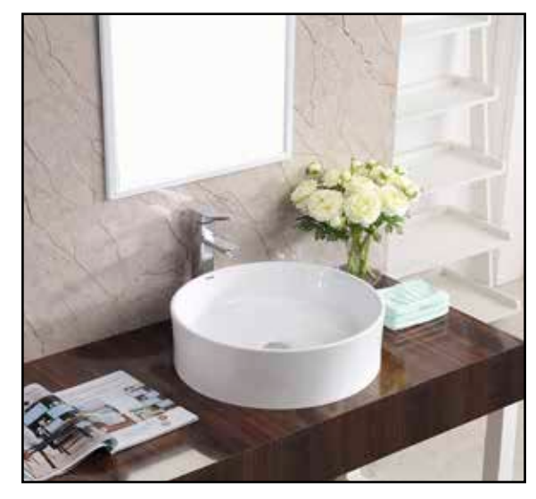
Installed Product Image

Please note: All porcelain sinks are fired at a very high temperature; final dimensions may vary slightly.