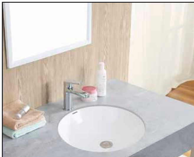
Installed Product Image

Please note: All porcelain sinks are fired at a very high temperature; final dimensions may vary slightly.