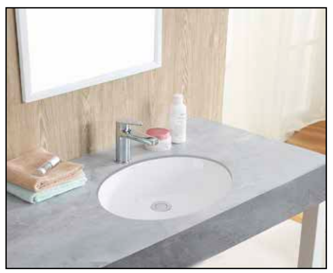
Installed Product Image