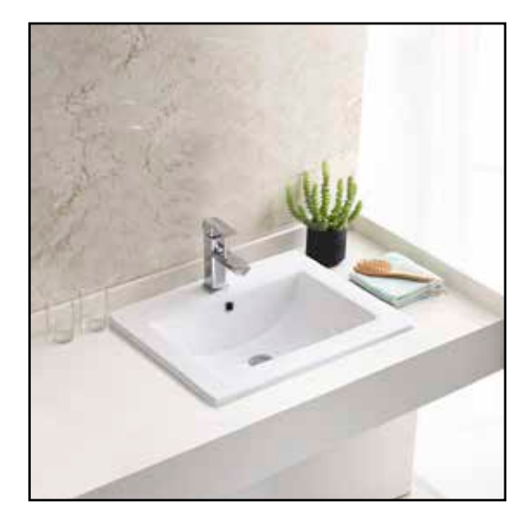
Installed Poduct Image

Please note: All porcelain sinks are fired at a very high temperature; final dimensions may vary slightly.