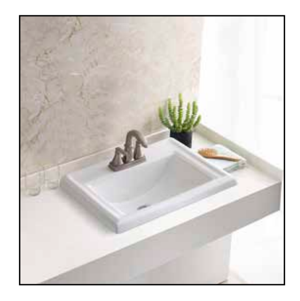
Installed Poduct Image

Please note: All porcelain sinks are fired at a very high temperature; final dimensions may vary slightly.