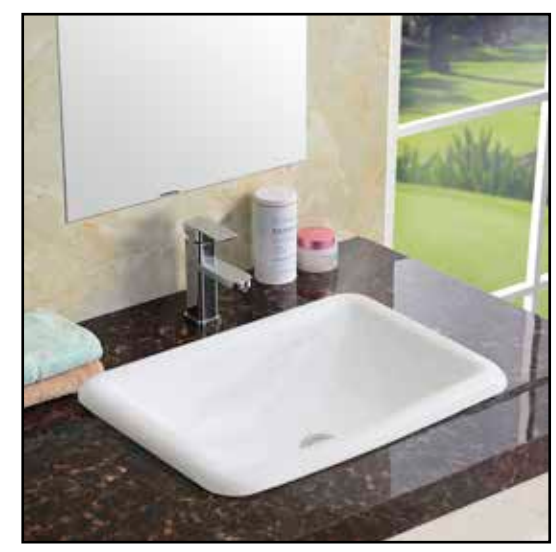
Installed Product Image

Please note: All porcelain sinks are fired at a very high temperature; final dimensions may vary slightly.