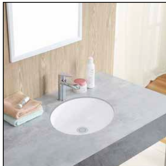
Installed Product Image

Please note: All porcelain sinks are fired at a very high temperature; final dimensions may vary slightly.