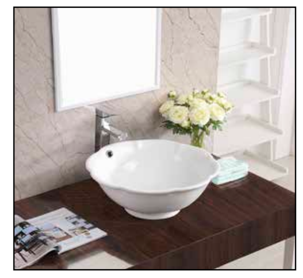
Installed Poduct Image

Please note: All porcelain sinks are fired at a very high temperature; final dimensions may vary slightly.