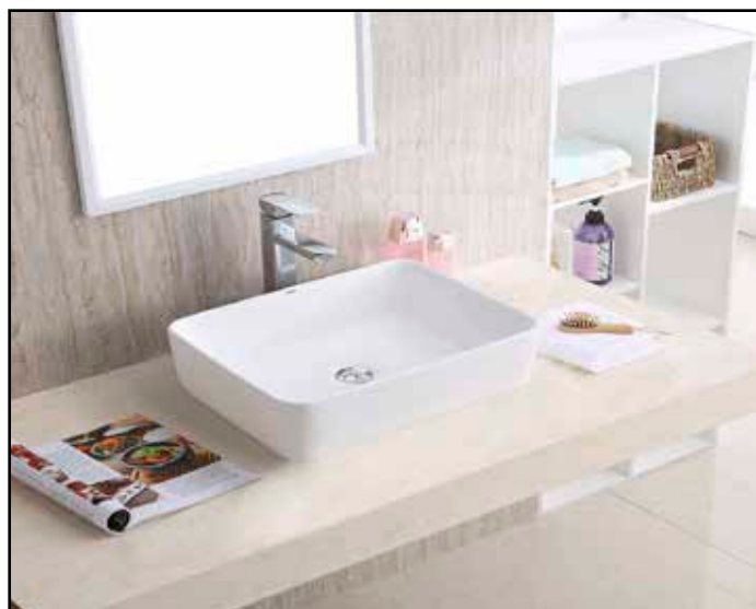
Installed Product Image

Please note: All porcelain sinks are fired at a very high temperature; final dimensions may vary slightly.