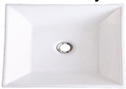
Dimensions Outer: 16-1/2" x 16-1/2" x 4-5/8" Inner: 15-1/4" x 15-1/4" x 3-3/8"