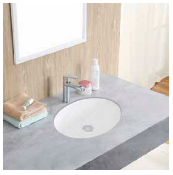
Installed Product Image

Please note: All porcelain sinks are fired at a very high temperature; final dimensions may vary slightly.